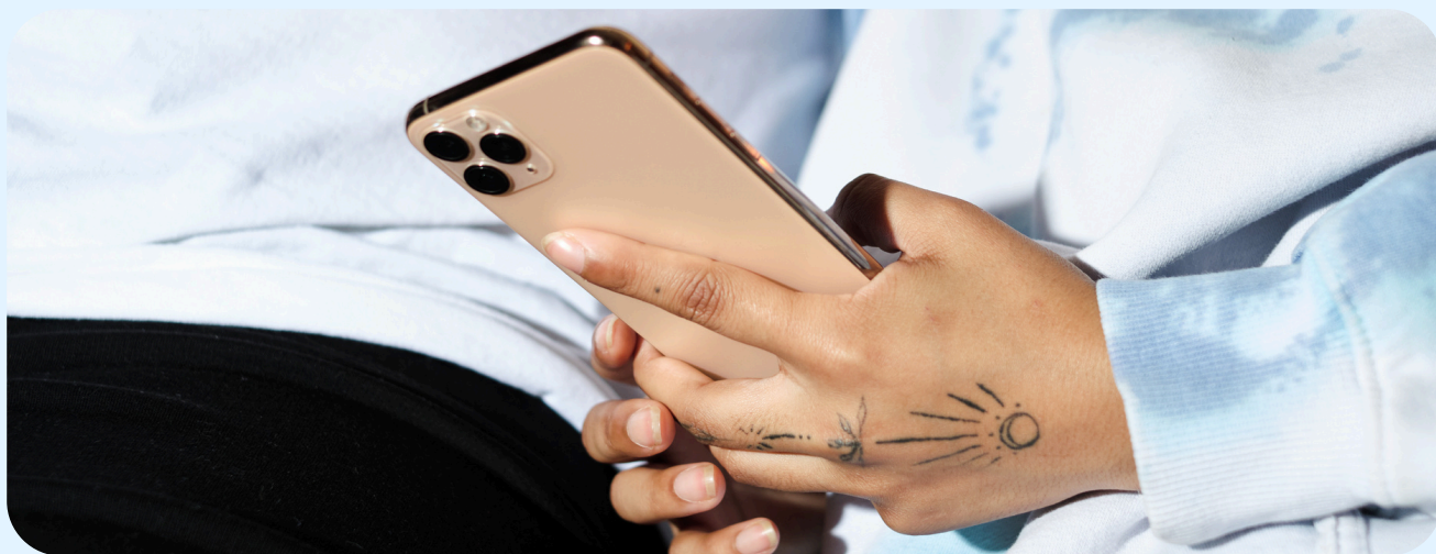
Gender Spectrum Collection

The company continues to provide no transparency on any proactive steps it takes to hire employees from diverse backgrounds. X should make a public commitment to diversifying its workforce, and should publish voluntarily disclosed data showing its progress towards reaching diversity and inclusion goals.