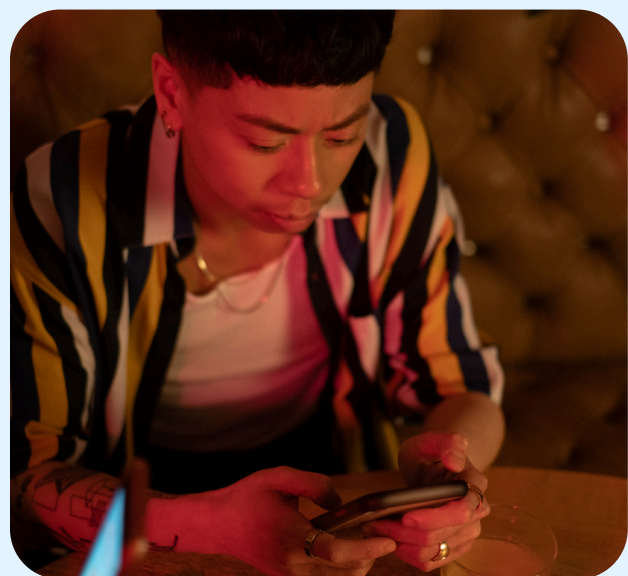
Gender Spectrum Collection

In its 2024 Diversity Annual Report , the company made a public commitment to taking proactive steps to diversify its workforce, and published voluntarily self-disclosed data on the number of LGBTQ employees. However, as has been reported more recently by mainstream news outlets, 41 Google is rolling back its DEI commitments in response to the Trump administration's Executive Orders on DEI. 42 Research for the 2025 SMSI Platform Scorecard is based on public-facing company policies published over the course of the last year, since the company has not added this major stated policy reversal in Google's commitment to diversity and inclusion to its published policies, this change is not reflected in this year's SMSI Platform Scorecard data and will be reflected in the 2026 research.