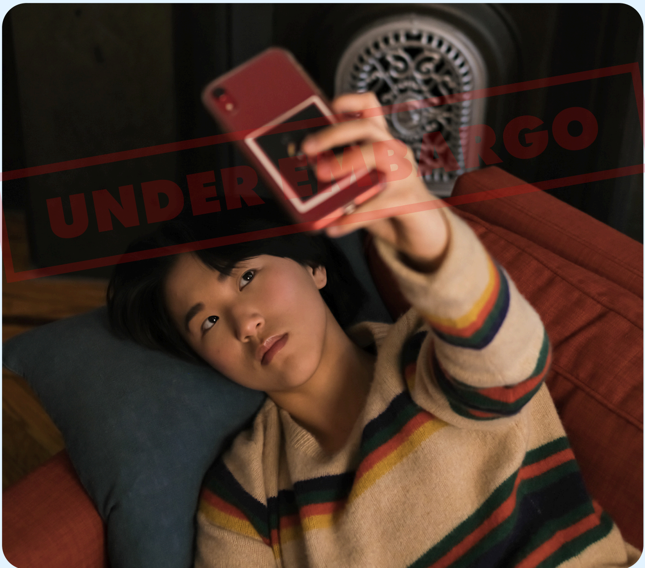
Gender Spectrum Collection

In its “ 2024 Responsible Business Practices Report ,” Meta made a commitment to “building a workforce that’s as diverse as the communities we serve.” In the same report, the company also published partial data on its LGBTQ workforce. However, the company announced more recently that it would abandon its diversity and inclusion efforts. 40 It is important to note that this significant policy reversal in Meta’s commitment to DEI is not reflected in the 2025 SMSI Platform Scorecard data. As our research for the SMSI Platform Scorecard is based on public-facing company policies published in the previous year, we expect that this policy change will be reflected in our 2026 Scorecard.