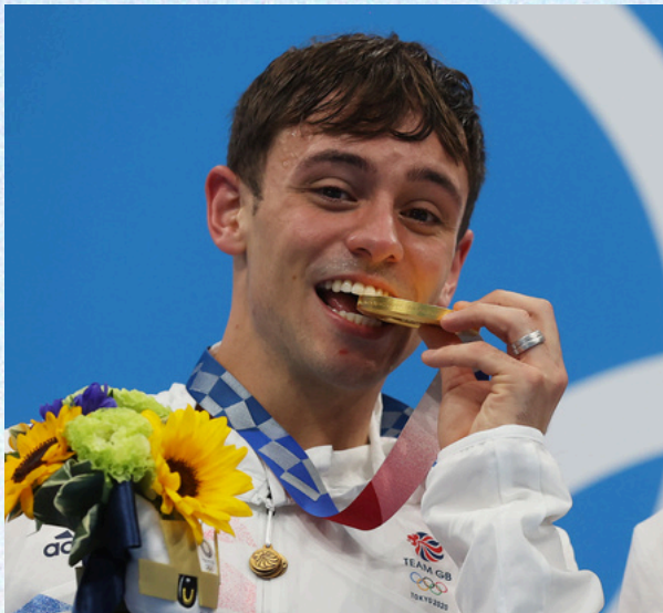
Tom Daley poses with his gold medal after winning the men’s synchronized 10m platform final at the 2020 Tokyo Olympic Games.

Despite this, several international sports federations have made changes to their eligibility requirements that have diminished or eliminated opportunities for transgender and intersex athletes to compete in the 2024 Paris Olympics and Paralympics. Often, these discriminatory policies go unnoticed with “less than half of Americans” reporting that they are aware of Olympic policies concerning transgender athletes. 5 Policies such as those enforced by World Aquatics and World Athletics are impediments to the Olympics’ ability to honor its core values. They also prevent opportunities for understanding and awareness related to the LGBTQ community. These independent sports federations are promoting an inaccurate depiction of the world by preventing trans and intersex athletes from competing in the Olympics and Paralympics. Considering that LGBTQ individuals have always existed, it is imperative that they be represented in a manner that is authentic to their identities.