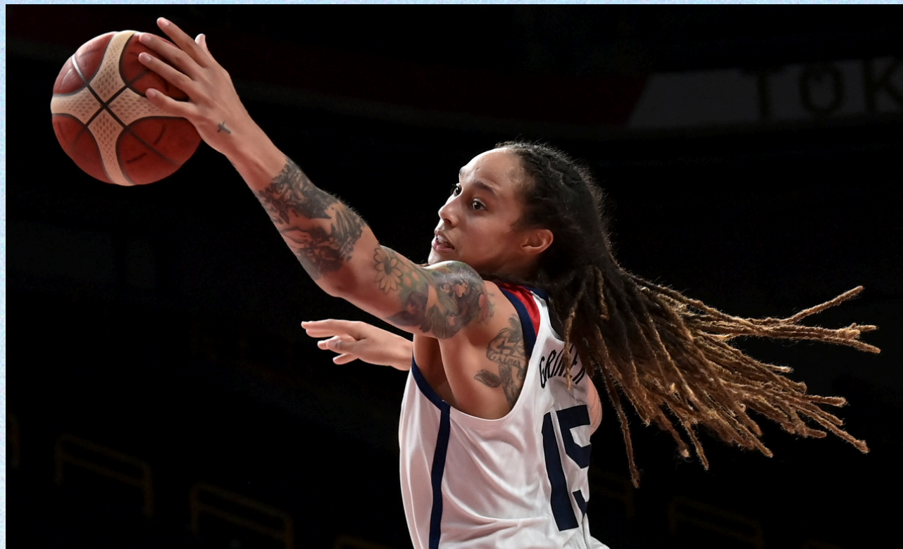
Brittney Griner of Team USA vies for the ball in the women's final basketball match against Japan during the 2020 Tokyo Olympic Games at the Saitama Super Arena.

Following is a list of just a few out LGBTQ athletes who are expected to compete in the 2024 Paris Olympic Games. It is important to note that, at the time of publication, the number of LGBTQ athletes competing in Paris is unclear as most athletes will continue to qualify throughout the spring and summer.