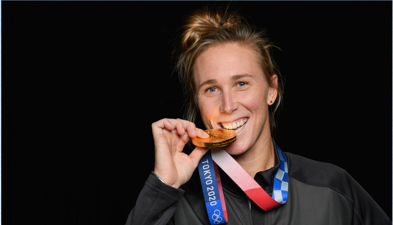
Single sculls gold medal winner Emma Twigg poses during a welcome home ceremony for New Zealand's 2020 Tokyo Olympic team.

EMMA TWIGG (she/her) is a rower from New Zealand who has medaled several times throughout her career, including winning the gold medal in single sculls at the 2014 World Championship in Amsterdam. In total, Twigg has qualified for 5 Olympic Games. The 2020 Tokyo Olympics were significant for multiple reasons: it was her first time competing as an out athlete, and she had won her first Olympic gold medal in women's single scull. Recognizing the power of her own platform, Twigg now views sports as an opportunity to effect positive change. In a 2020 interview with Outsports she said, "If by reading my story someone feels more confident, then that's a great thing . . . even if it just helps one young kid or aspiring athlete that is struggling with their sexuality." 19