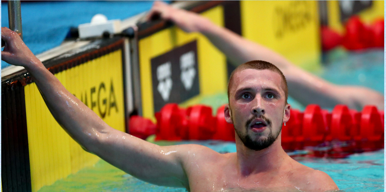
Daniel Jervis of Great Britain looks on after competing in the men’s 1500m heats of the Manchester International Swimming Meet in 2021.

DANIEL JERVIS (he/him) is an openly gay swimmer who will once again compete for Great Britain at the 2024 Paris Olympics. He chose to come out in 2022 ahead of the Commonwealth Games. He had previously won silver and bronze medals in the 1500m freestyle in 2018 and 2014, respectively, during the Commonwealth Games. He wanted to come out to make a statement, for him “to be [visible] on that stage and to inspire people.” 15 In a 2023 interview, Jervis told Attitude that being Christian was the most important thing for him. 16 While discussing faith he remarked: “I think there has always been this thing where you can’t be Christian and be gay.