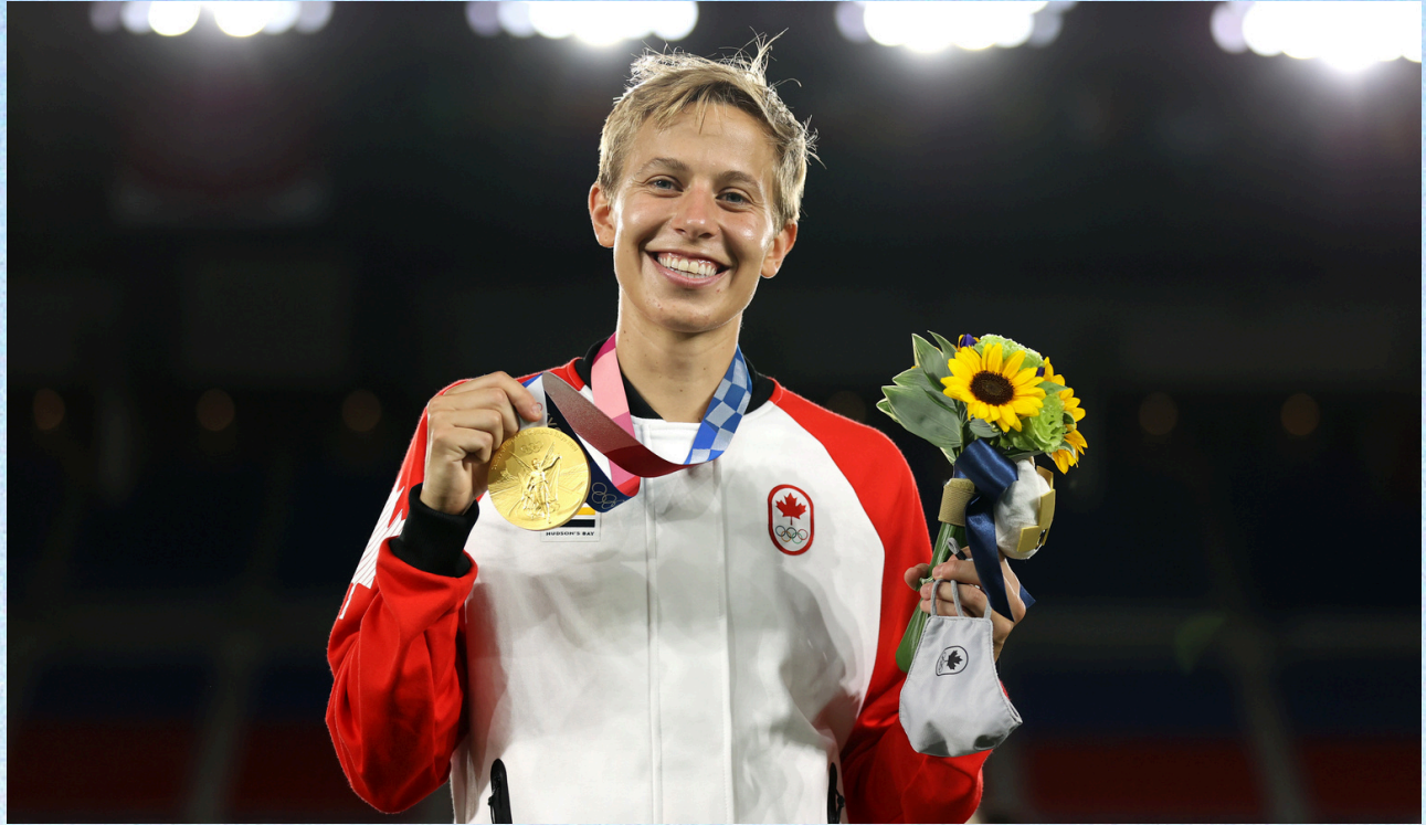
Gold medalist Quinn of Team Canada poses with their medal at the 2020 Tokyo Olympics.

QUINN (they/them) is a Canadian professional soccer player who plays midfield on Canada Soccer's Women's National Team. At the 2020 Tokyo Olympics, they made history as the first-ever trans and nonbinary gold medalist. In September 2020, they took to X (formerly Twitter) to express their frustration with reporters, saying, "Nearly every publication, including LGBTQ news sources, has used my deadname while reporting my story." 21 They asked reporters and media outlets to "do your research, change your headlines, and grow." 22 In a 2021 interview on The Trans Sporter Room podcast, Quinn remarked, "One of the reasons I came out was to use my platform and I'm hoping with my voice I can help uplift other trans voices in our community." 23 Two years later, they made history again by becoming the first trans or nonbinary footballer to compete at the FIFA World Cup. Quinn will continue to serve as a role model for young trans and nonbinary athletes by donning their Canadian kit and competing in the 2024 Paris Olympics.