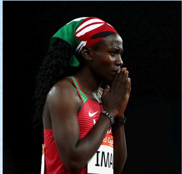
Maximila Imali of Kenya looks on prior to the women’s 400m final during the 2018 Commonwealth Games at the Gold Coast.

Intersex athletes have also always existed and competed in sports, with one of the earliest known instances being the Polish track athlete Stanisława Walasiewicz. Recently, intersex athletes have been threatened due to the discriminatory policies implemented by international sports federations.