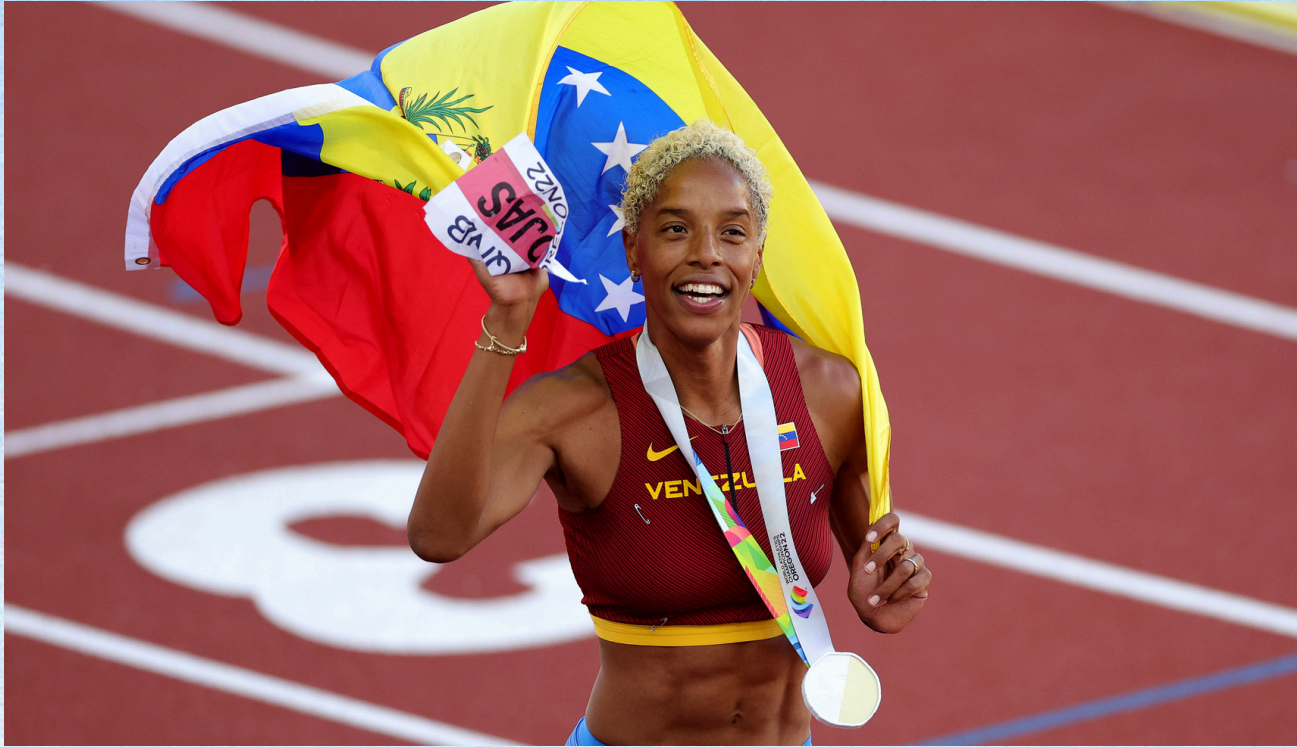
Gold medalist Yulimar Rojas of Team Venezuela celebrates after winning the women's triple jump final of the World Athletics Championships in 2022.

YULIMAR ROJAS (she/her) is a Venezuelan track and field athlete known as la reina del triple salto—queen of the triple jump. In 2022, she set the triple jump world record, jumping 15.74 meters (51.64 feet). In her incredible career, Rojas has won several gold medals, the first of which in Tokyo at the 2020 Olympic Games. Moreover, in 2020, she was named World Athletics Female Athlete of the year, making her the first Venezuelan to receive the honor. 26 On and off the track, Rojas is a champion of LGBTQ rights in Venezuela. In a 2020 interview with El País , Rojas stated, “My orientation, my sexuality has always been important to me and to my career. Since I have started sports, I have always tried to fight for the ideologies and rights of women and the LGBT community.” 27 As an out lesbian, Rojas is a role model and guiding light for the LGBTQ community.