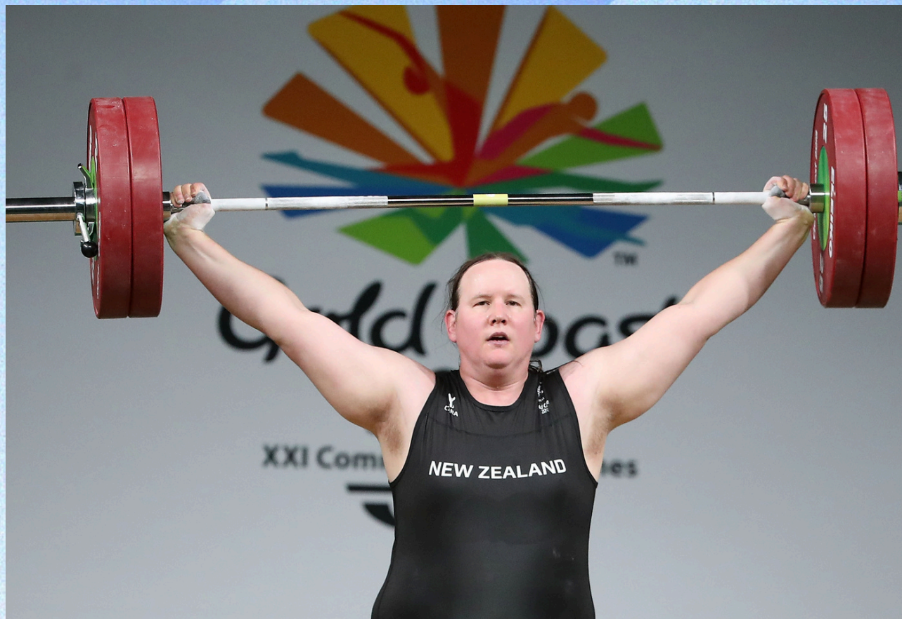
Laurel Hubbard of New Zealand competes in the women's weightlifting +90kg final during the 2018 Commonwealth Games in the Golden Coast.

In 2021, New Zealand weightlifter Laurel Hubbard became the first out transgender athlete to qualify for Olympic competition, followed by Canadian soccer player Quinn, who also became the first out transgender Olympic medalist. 34 American BMX freestyle athlete Chelsea Wolfe qualified as an alternate for Team USA, 35 making her the first transgender Team USA athlete at an Olympic competition (though not the first transgender athlete to make Team USA; Hall of Fame triathlete and All-American duathlete Chris Mosier is a 6-time member of Team USA). Australian track and field athlete Robyn Lambird became the first publicly out nonbinary athlete to win a Paralympic medal. 36