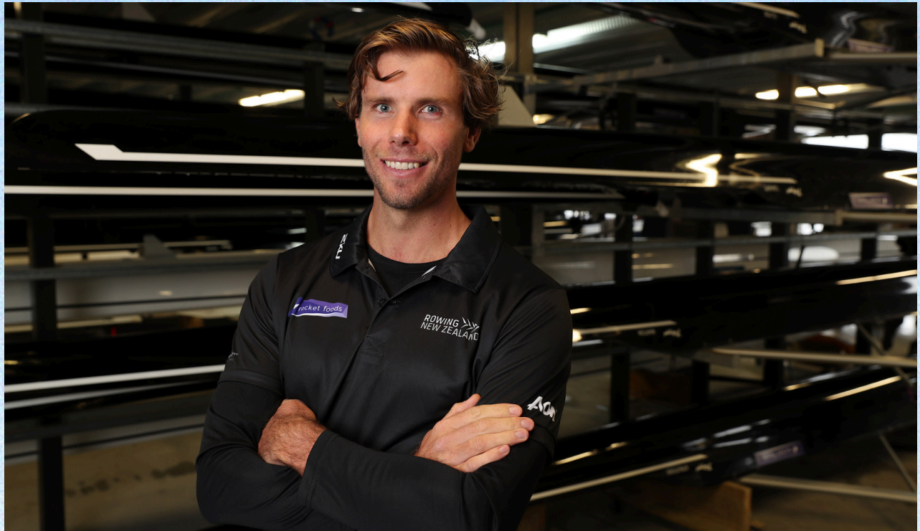
Robbie Manson, men's elite single scull rower, during the New Zealand Rowing media day at Lake Karapiro in 2019.

ROBBIE MANSON (he/him) is a rower from New Zealand and 4-time Olympic qualifier. During his appearance at the 2016 Rio Olympics, he was one of just 11 out gay or bisexual men competing among more than 6,000 athletes. 24 When the 2020 Tokyo Olympics were postponed due to COVID-19, Manson entered retirement. However, with the support of his teammates, Manson is stepping up again to represent New Zealand in the 2024 Paris Olympics. Acknowledging how LGBTQ visibility in sports could have helped him when he was younger, Manson decided to come out publicly to help others in similar circumstances.