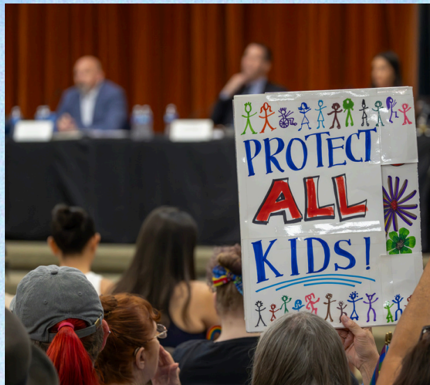
A person holds a sign in opposition to a policy that the Chino Valley school board is meeting to vote on which would require school staff to "out" students to their parents if they ask to be identified by a gender that is not listed on their birth certificate on July 20, 2023 in Chino, California.