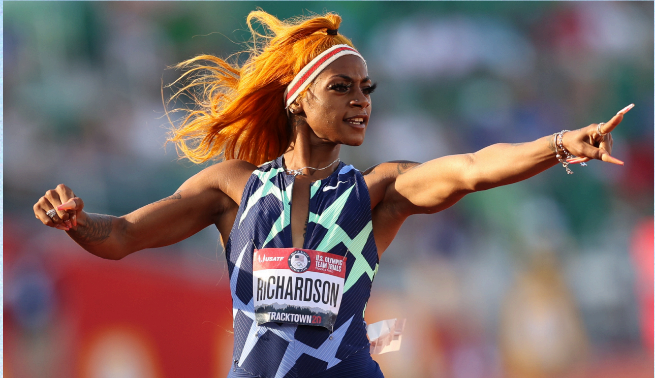
Sha'Carri Richardson runs and celebrates in the women's 100m semifinal on day 2 of the 2020 US Olympic Track & Field Team Trials at Hayward Field.

SHA' CARRI RICHARDSON (she/her) is an American track and field sprinter known for being the fastest woman in the world, an out LGBTQ athlete, and outspoken character. Richardson publicly came out as bisexual in 2015 on X (formerly Twitter). 25 Since then, she has become a decorated sprinter. Recently Richardson won two gold medals in the 100m and 4x100m relay at the 2023 World Championships in Budapest. Having missed the 2020 Tokyo Summer Olympics after failing a test for marijuana, Sha'Carri Richardson is determined to make her mark on the track at this summer's Olympic Games in Paris.