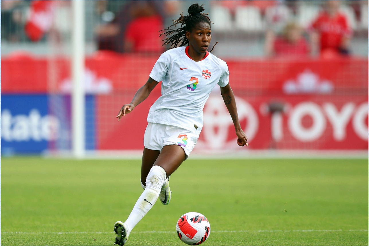
Kadeisha Buchanan of Team Canada dribbles the ball during a friendly match against South Korea in 2022.

KADEISHA BUCHANAN (she/her) will return as a center back for the Canadian women's soccer team in the 2024 Paris Olympics. As a professional footballer, she has received numerous accolades, including winning the Canadian Player of the Year award in 2015, 2017, and 2020, as well as the FIFA Young Player Award at the 2015 Women's World Cup. 20 At the 2020 Tokyo Olympics, Buchanan and others helped make history as the first Canadian women's football team to win an Olympic gold medal. As the defending champions, the gold medal-winning Canadian women's soccer team will be looking to her for experience and leadership as this will mark her third appearance at the Olympic Games.